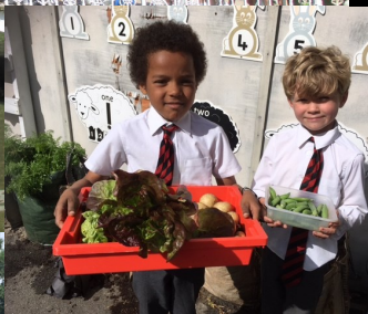
Vegetables aplenty from Gardening Club, Year 1's There's a Sunflower in my Supper Assembly , proud Year 5 KCS Maths Challenge boys and Year 6 Mindfulness