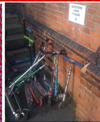
Please place all scooters here on the left inside the black gate

My name is Deniz and I am looking for a fulltime live-out sole charge nanny position. I have 6 years' experience, First Aid, recent CRB check and current references. I recently worked for the Croz family from Willington. I have also completed a non medical maternity nursing course. Contact me on 07742 018351.