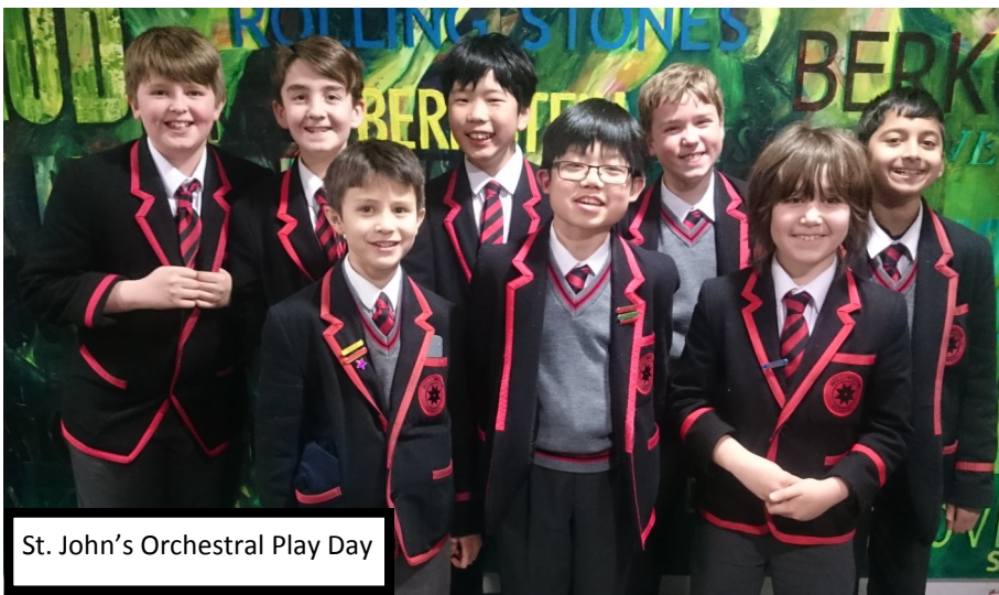
St. John's Orchestral Play Day